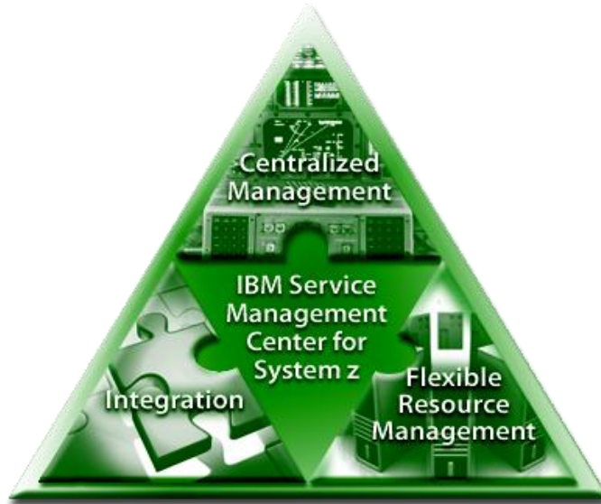
Figure 2: The 3 Foundations of IBM Service Management Center for System z

It is important to note that IBM offers a variety of Tivoli management solutions. But most IT managers also use management software products offered by 3 rd party suppliers. IBM's Tivoli architecture has been designed to allow these 3 rd party solutions to become part of an overall service management solution. Figure 2 illustrates this emphasis on flexible management — as well as showing how integration and consolidated resource management are key building blocks that contribute to the make-up of IBM Service Management Center for System z.